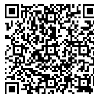
Scan to take the Survey