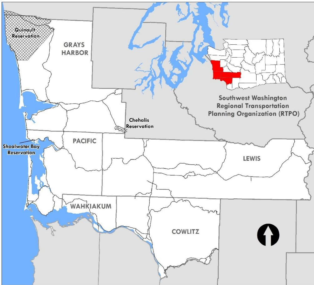
Figure 2: Southwest Washington RTPO Planning Area

The planning and programming efforts of the MPO and RTPO are interconnected in planning tasks fulfilling federal and state transportation planning requirements. Metropolitan transportation planning requirements must be fulfilled in order for transportation projects to be eligible for federal funding. The UPWP is the tool used to direct these continuous, cooperative, and comprehensive planning efforts. The UPWP provides the CWCOG with guidance in performing transportation-related tasks necessary to meet MPO and RTPO planning requirements.